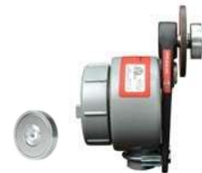
MM-2.00 Mounting Magnet Option (must be used with EZ-SCP)