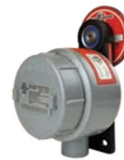
EZ-SCP Mounting Option